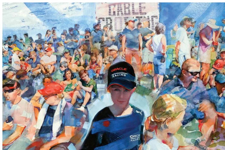
America's Cup, Newport

Good question. Something I wrestle with always. Sometimes 80% of the painting is resolved and 20% bugs the hell out of me. In a portrait, I look for the life or energy of the subject to come off the page and have a presence. It ain't easy but I enjoy the struggle.