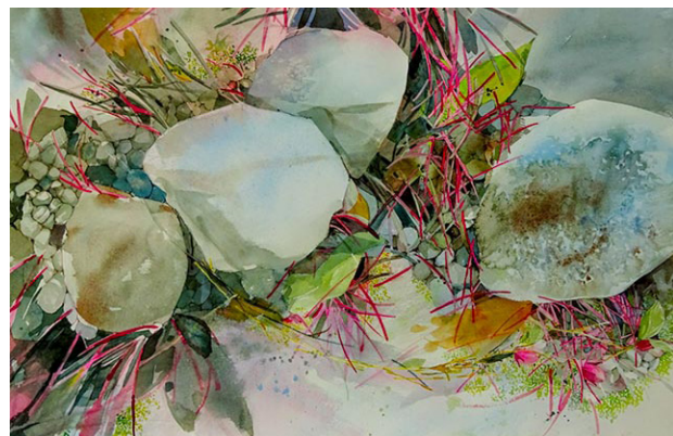
I'm On the Path

I decided early on in my journey in the arts that watercolor would be my medium to master. My graphic design background/career pulls me towards simple compositions, incorporating shape/color relationships and calligraphic elements.