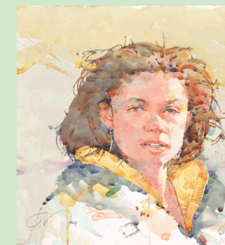
"Girl In Motion" by Ted Nuttall

*Please note: Dates have changed due to the new gallery hours*