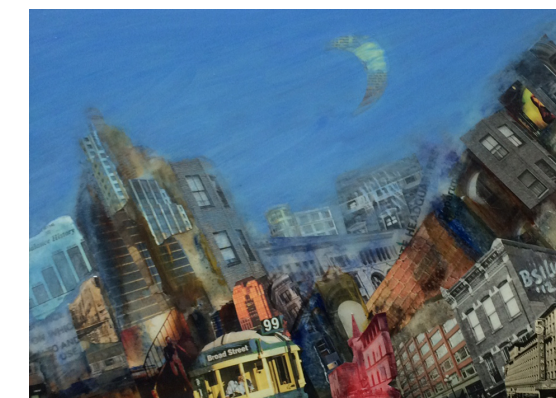
3rd Place Cityscape IV Beverly Silva

Thank you to all that participated in such a diverse exhibit. It was a great way to wrap up the RIWS 2015 Exhibitions!