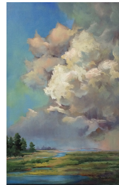
2nd Place Chance of Showers Donato Beauchaine

Thank you to all that participated in such a diverse exhibit. It was a great way to wrap up the RIWS 2015 Exhibitions!