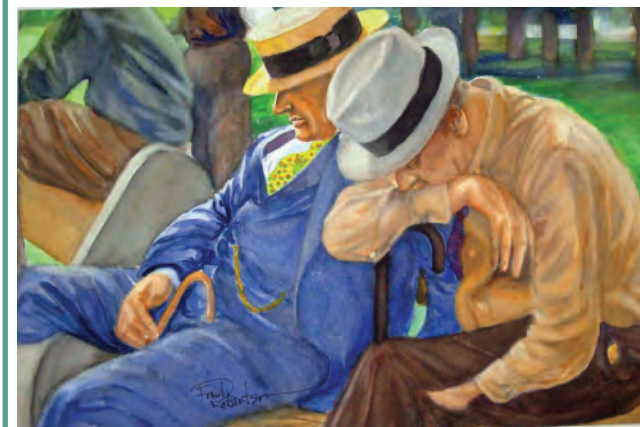
"Sweet Dreams and Memories"