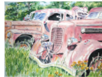
"Steere Farm Firetrucks" Elaine Gauthier