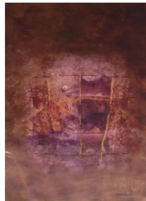
First Place Awarded "Sole Passage" by Cynthia DiDontato