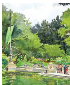
"Bethesda Terrace, Central Park NYC"