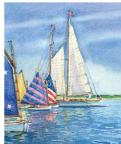
"Rainbow Fleet, Nantucket"