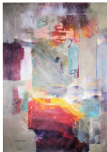
"Points of Interest"