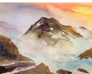
"Dawning Spray" Ben Macomber

Come join us for our fall Children's Art Class! Students will be introduced to a variety of mediums including watercolor, acrylic, collage and unconventional media. Weekly projects will be tailored to students age and skill level, and will result in a completed piece of art after every class. All materials and light snacks provided.