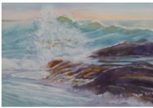
"Morning Drama" Kris Occhino

This class will emphasize painting rocks, trees, water and buildings that can be used to create a landscape. Emphasis will be in mixing colors directly on the paper, learning to use controlled washes and creating textures that simulate actual objects used to paint a landscape. This six week class will have students using photos of their own to learn the basics of watercolor and how to push it to more than just copying the photo.